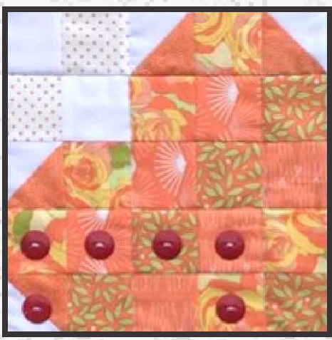
Love Is All Around You