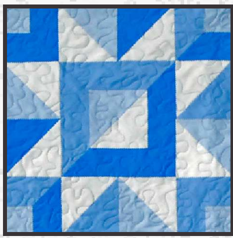
Nothing But Triangles