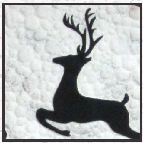
Heart to Hart