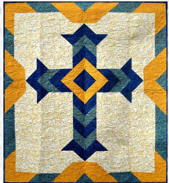
The Cross Quilt