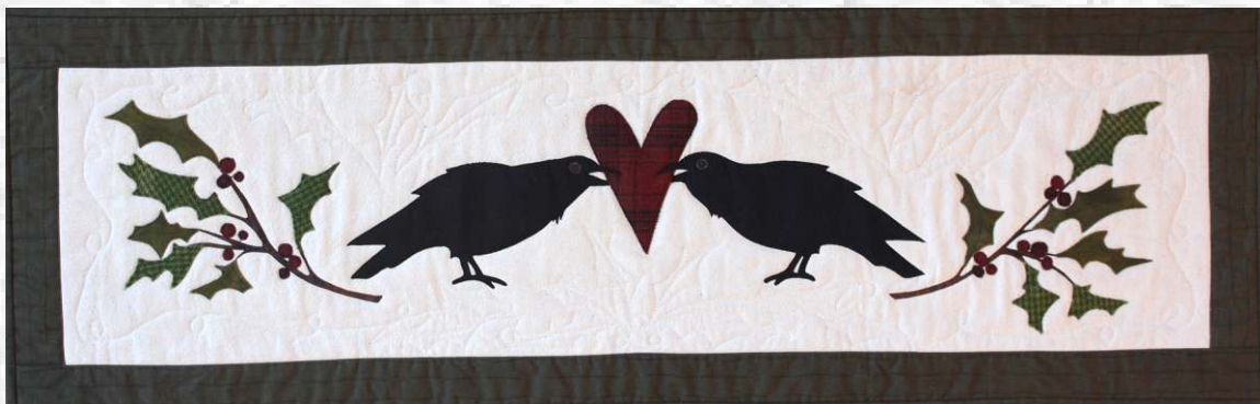
The Well Wishers