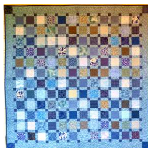
12 Big Block Feeling Blue by Susan-Claire Mayfield Gettin' The Scrappy Blues

Features 38 Orange Crush by Karen Gass (back cover)