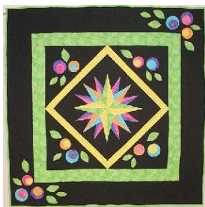
6 Color Explosion by Kristi Parker Play With Colors