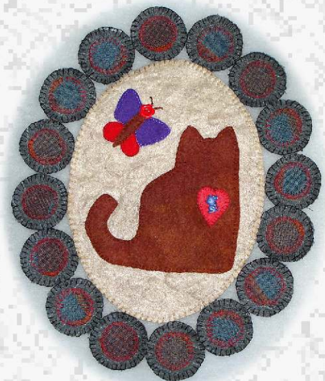
Kitty Penny Rug