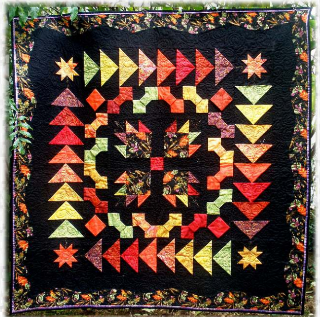
Colors of October