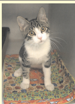
Pretty Girl is an HSPPR adoptee on her Kennel Quilt during the 2012 Colorado fires.

The readers of TQPM responded with over 100 quilts sent from the USA, Canada and England. As a result of the overwhelming response, TQPM and Petfinder Foundation formed the TQPM Small Kennel Quilt Team .