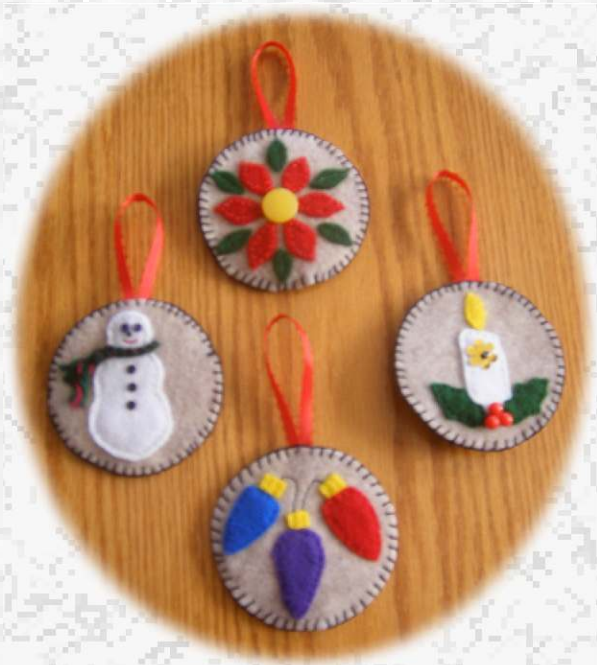
Penny Rug Ornaments