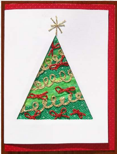
No-Sew Christmas Tree Card